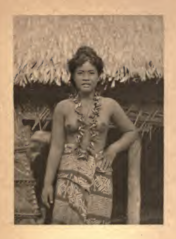
THE TAUPO FUAMOA.